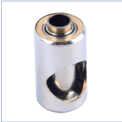
Wrench Type Turbine Cartridge For NSK Handpiece