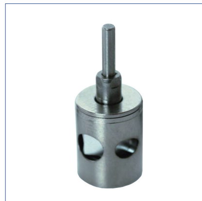
Dental Turbine Cartridge For Wrench Type Standard Handpiece For PANA AIR Wrench Standard Handpiece