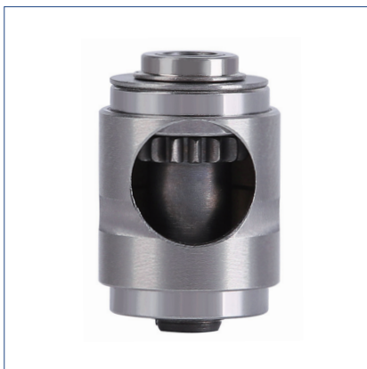
Dental Turbine Cartridge For AZDENT Handpiece