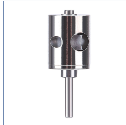
Push Button Standard Turbine Cartridge For PANA AIR Standard Handpiece