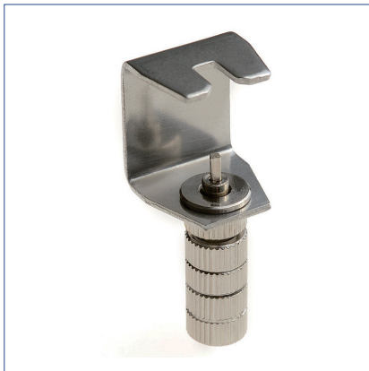
Dental Wrench Key For High Speed Handpiece Burs Changing