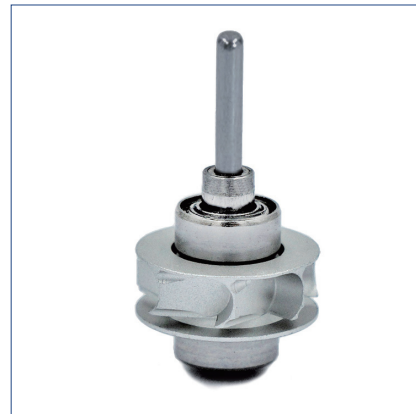
Turbine Cartridge For Handpiece Apply to KAVO 8000 Handpiece